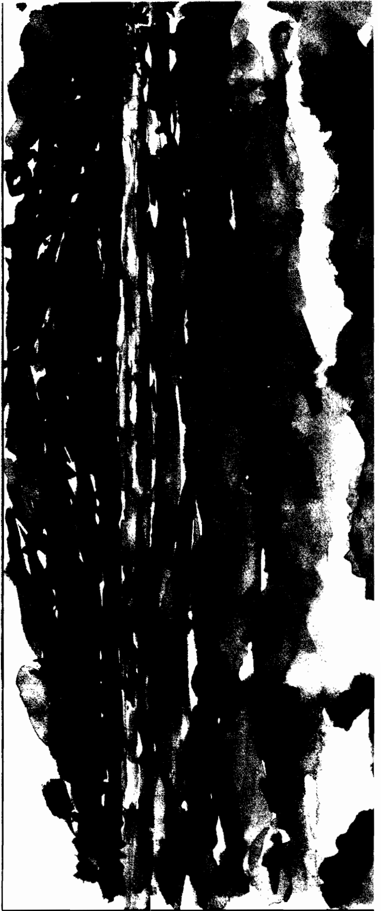
—WATERCOLOR FIELD STUDY—