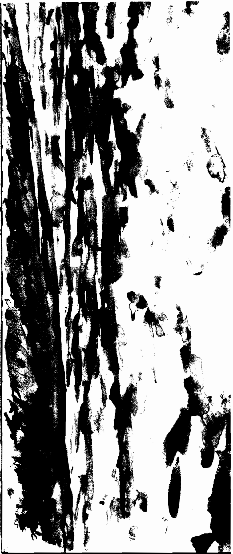
- WATERCOLOR FIELD STUDY -