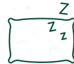
Bedding for XL Twin Mattress