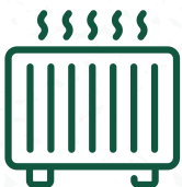
Electric Space Heaters