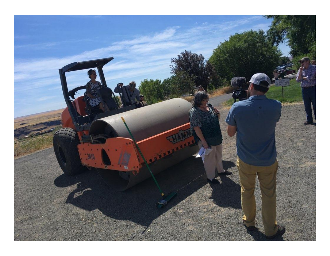
article: <a href="https://couriernews.com/Content/Default/News/Article/A-mother-a-son-and-a-work-of-art/-3/12/57811">https://couriernews.com/Content/Default/News/Article/A-mother-a-son-and-a-work-of-art/-3/12/57811</a>