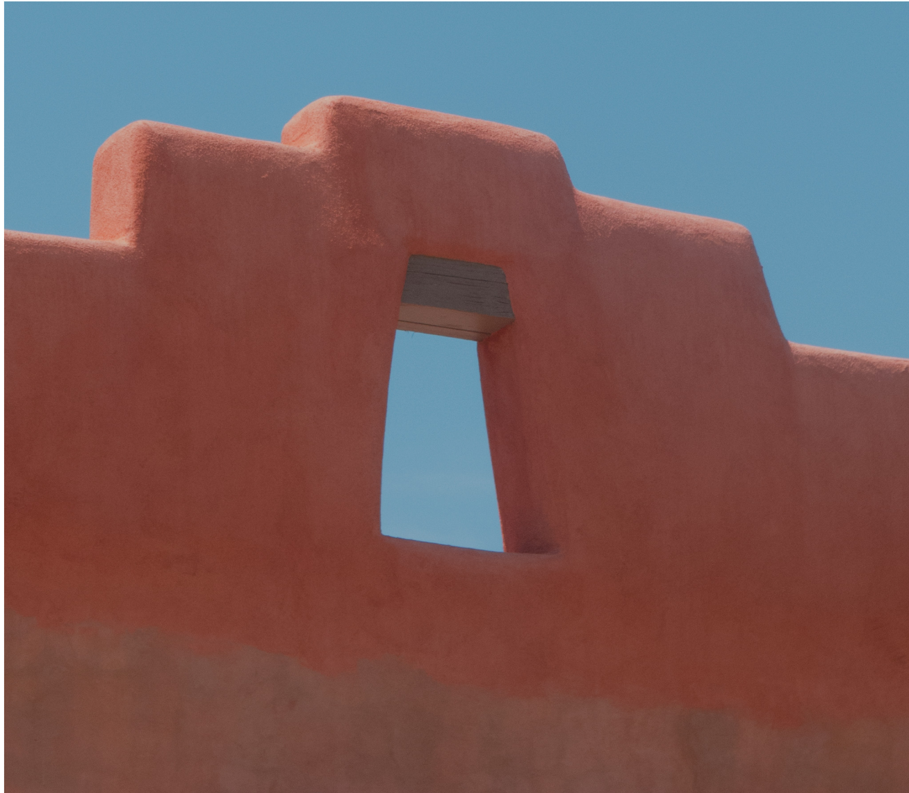
“Sky Window” Digital Photography Print 2014