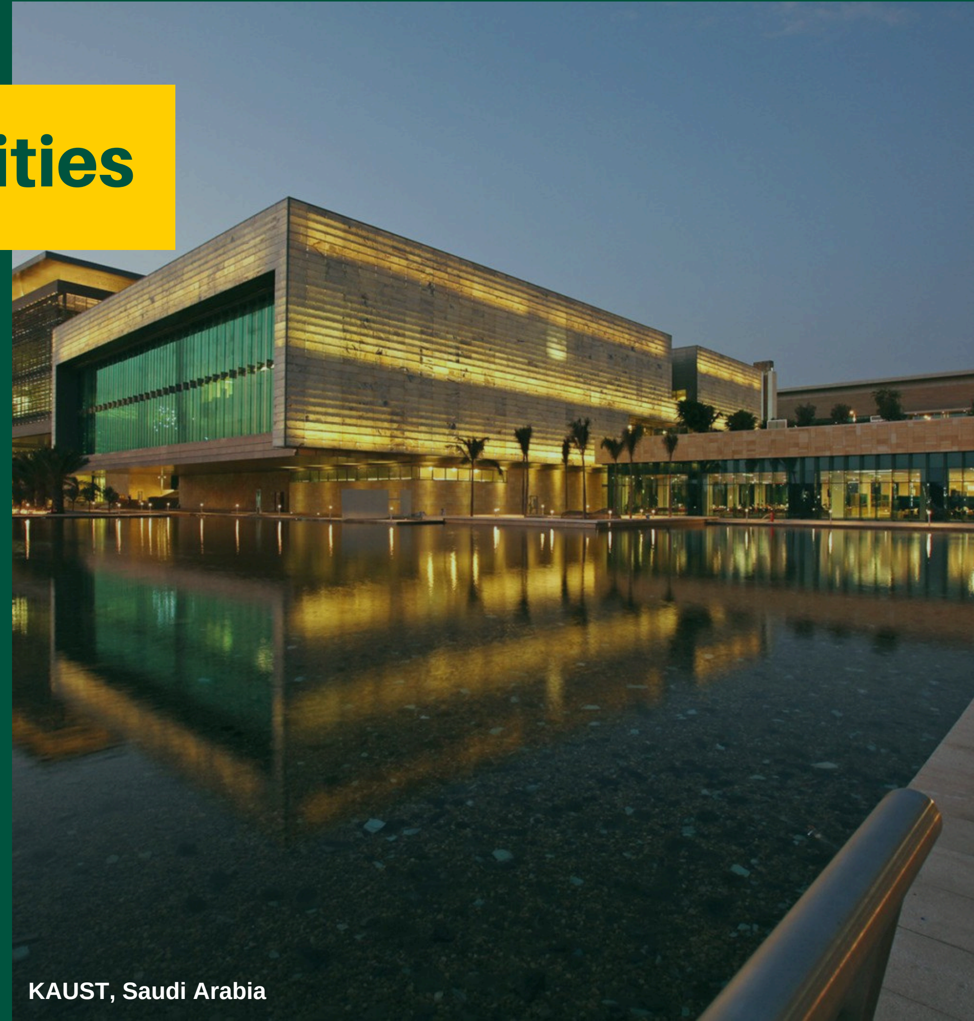
KAUST, Saudi Arabia