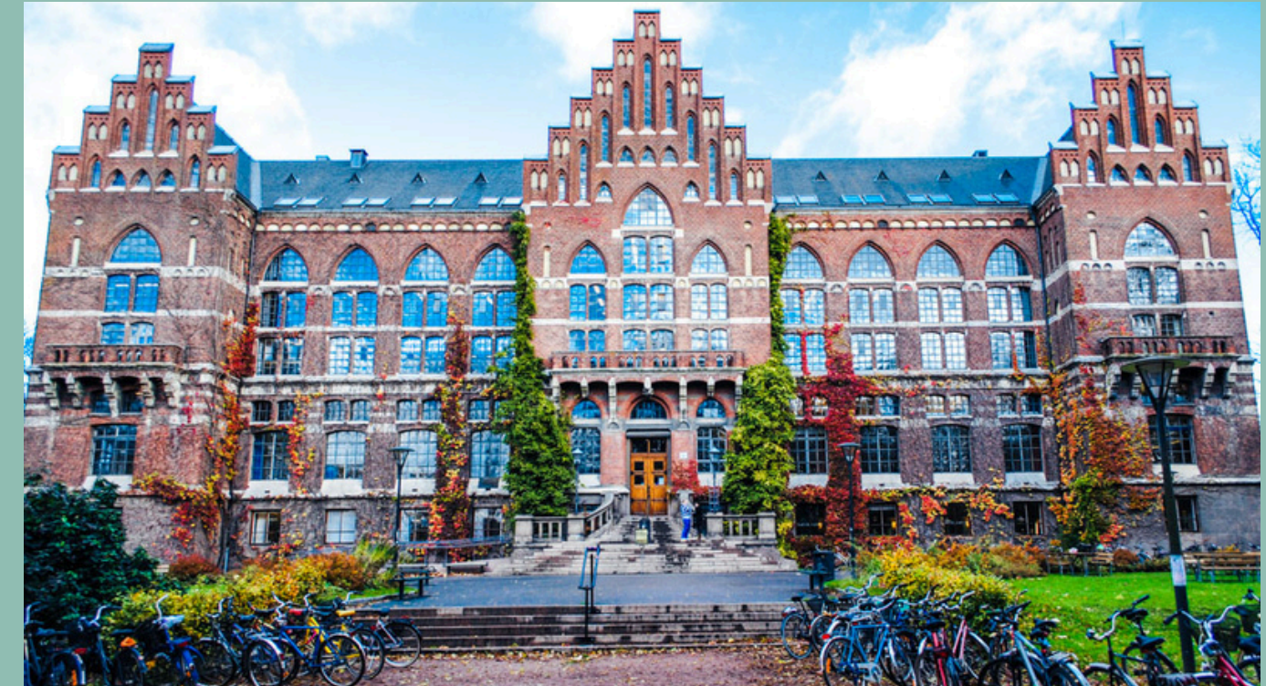
Lund University, Sweden

Securing funding as an international student to a foreign university can be extremely difficult. Usually, scholarships are externally secured or are large, very competitive university-wide scholarships, rather than partial.