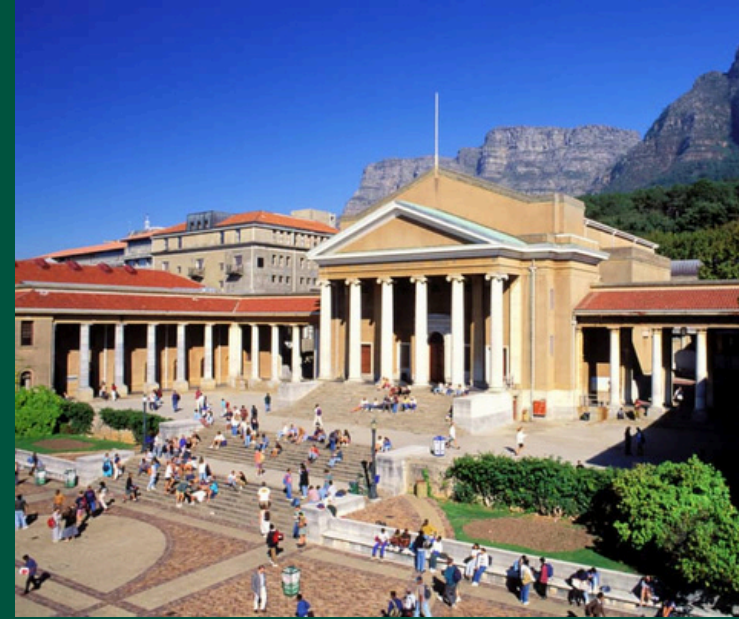
University of Cape Town, South Africa

Looking to challenge yourself in a new environment or connect personal interests.