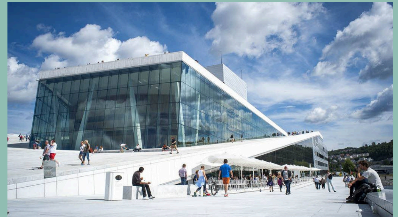
University of Oslo, Norway