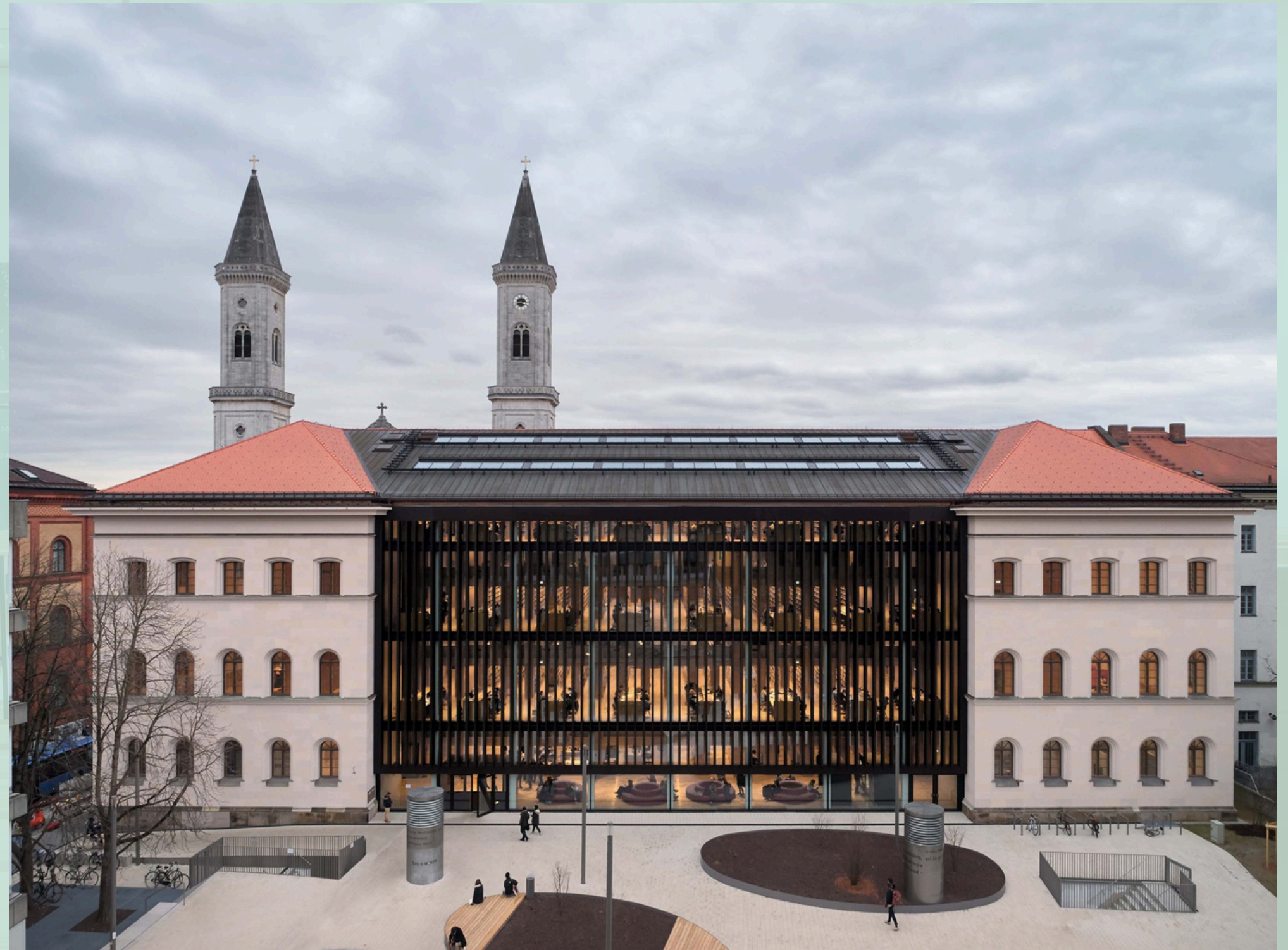
LMU Munich, Germany