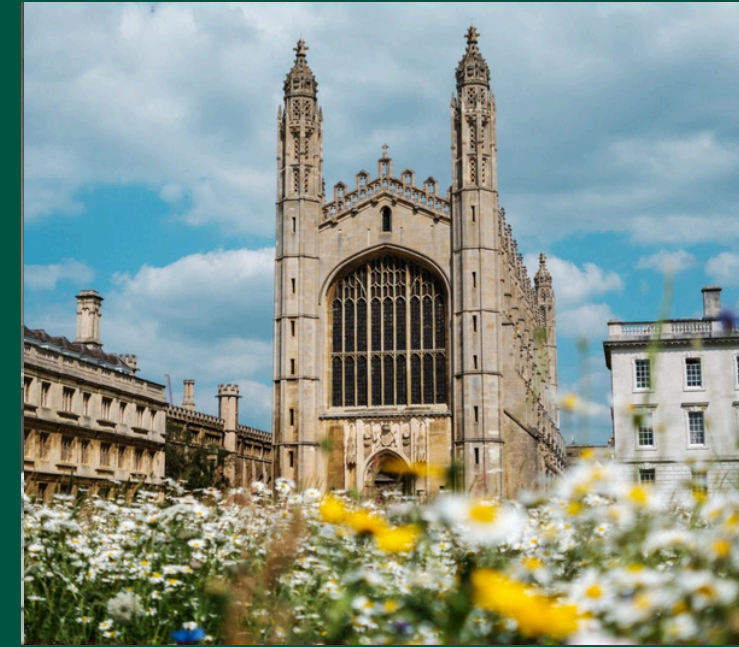
University of Cambridge, UK

International student looking to pursue degree in home country or domestic student looking to study in country they studied abroad in.