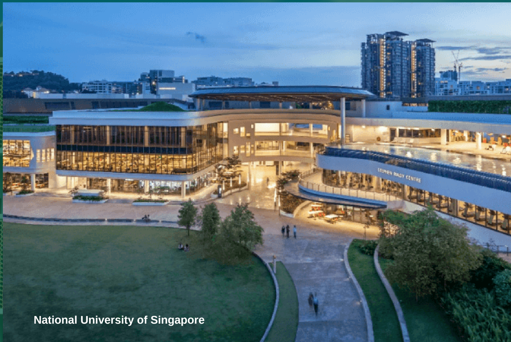
National University of Singapore