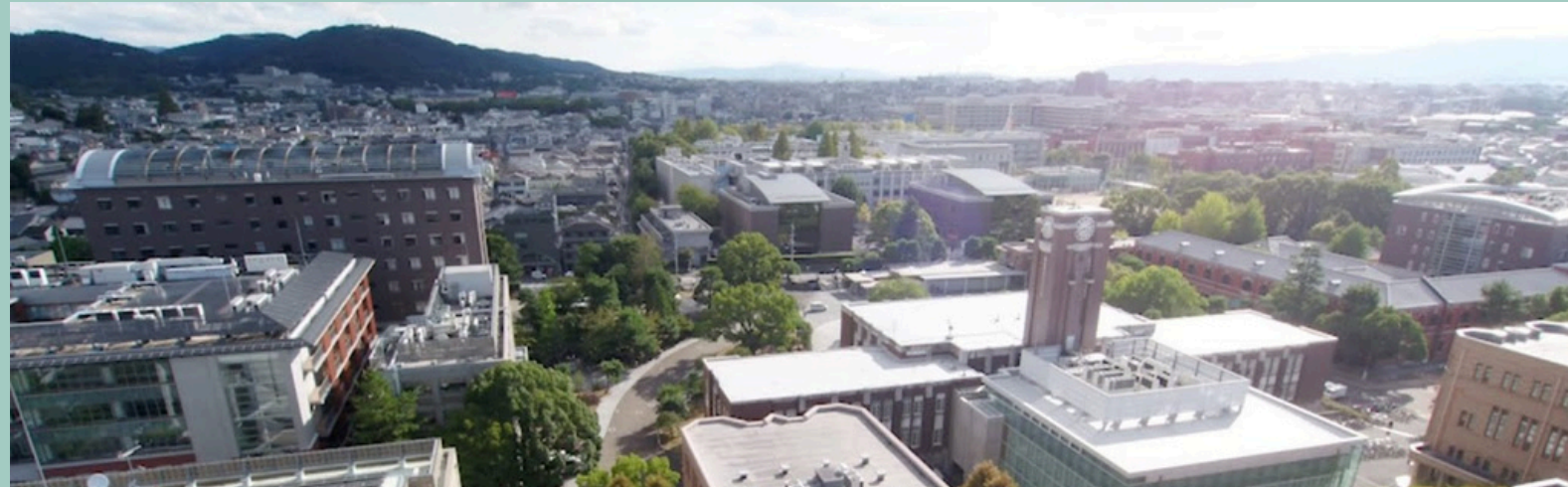
Kyoto University, Japan