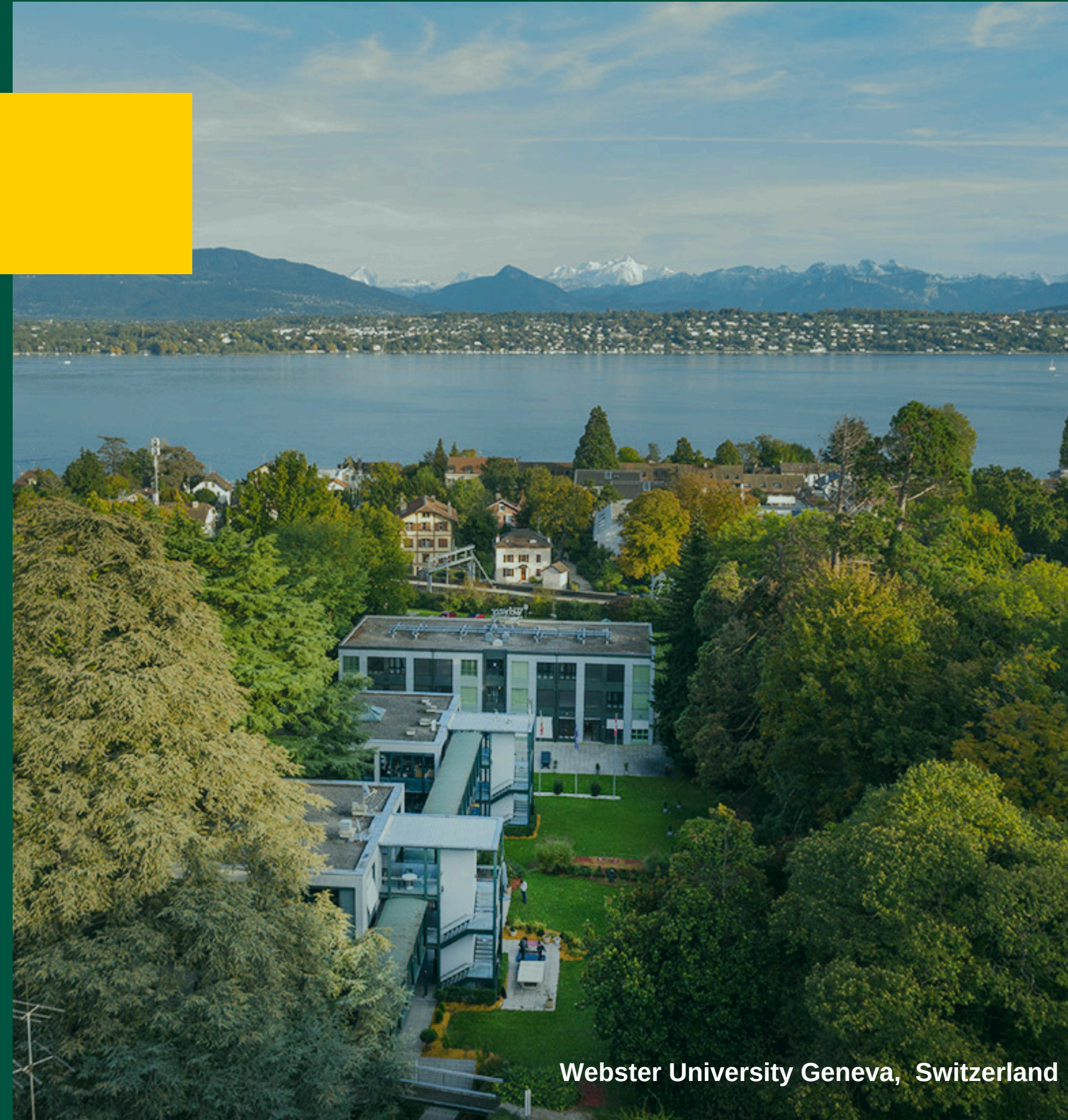
Webster University Geneva, Switzerland