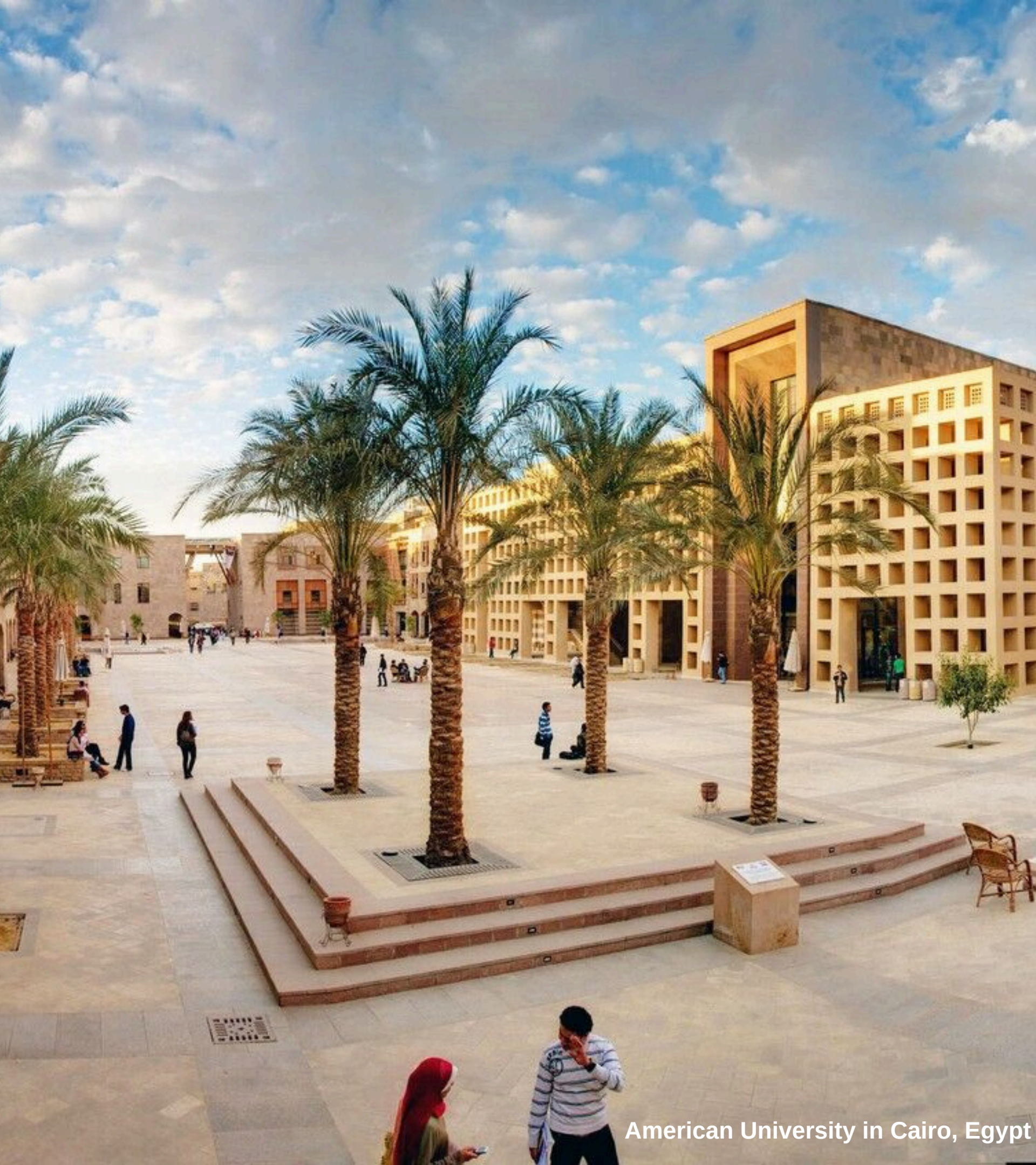
American University in Cairo, Egypt