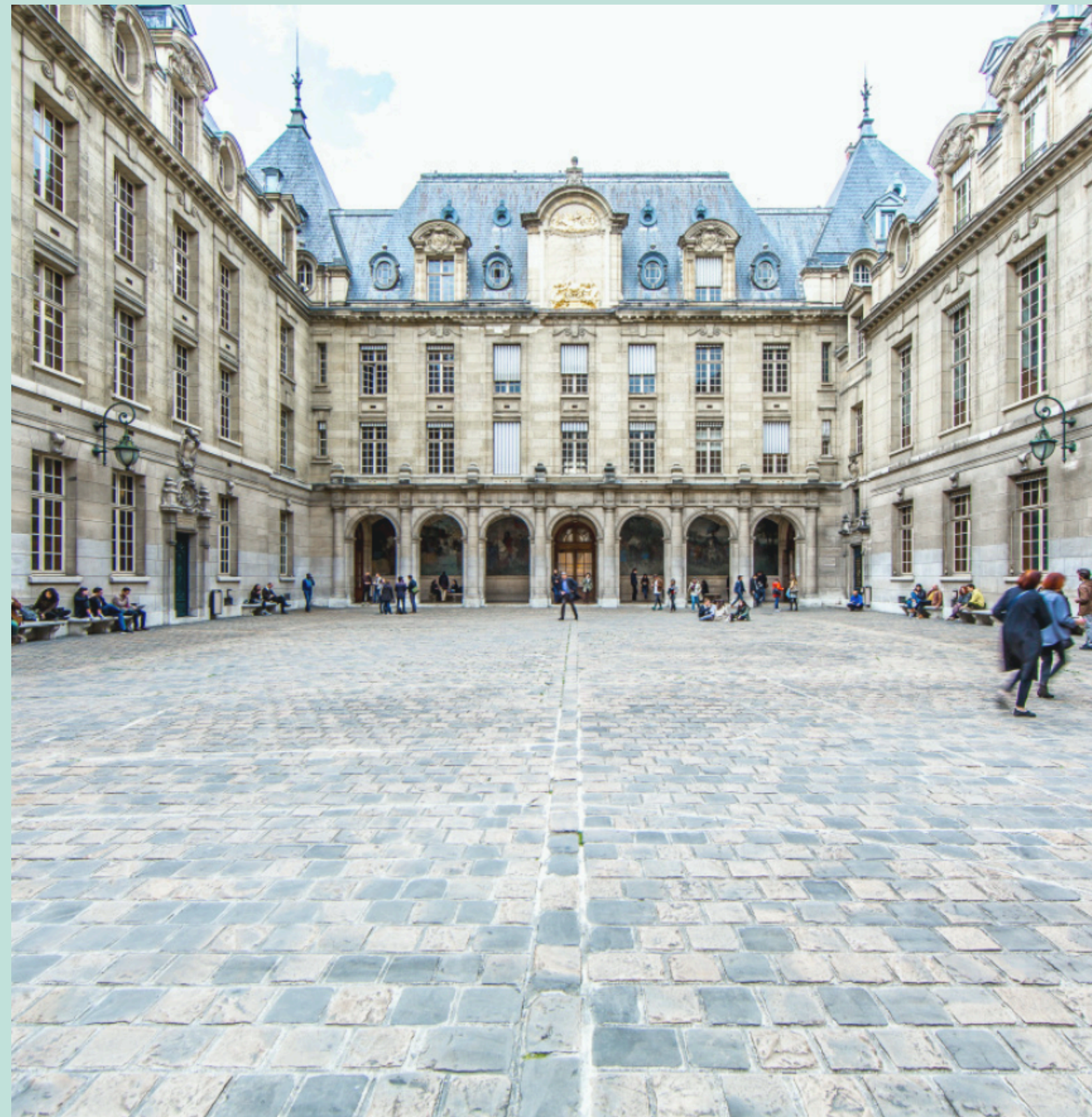
Sorbonne University, France