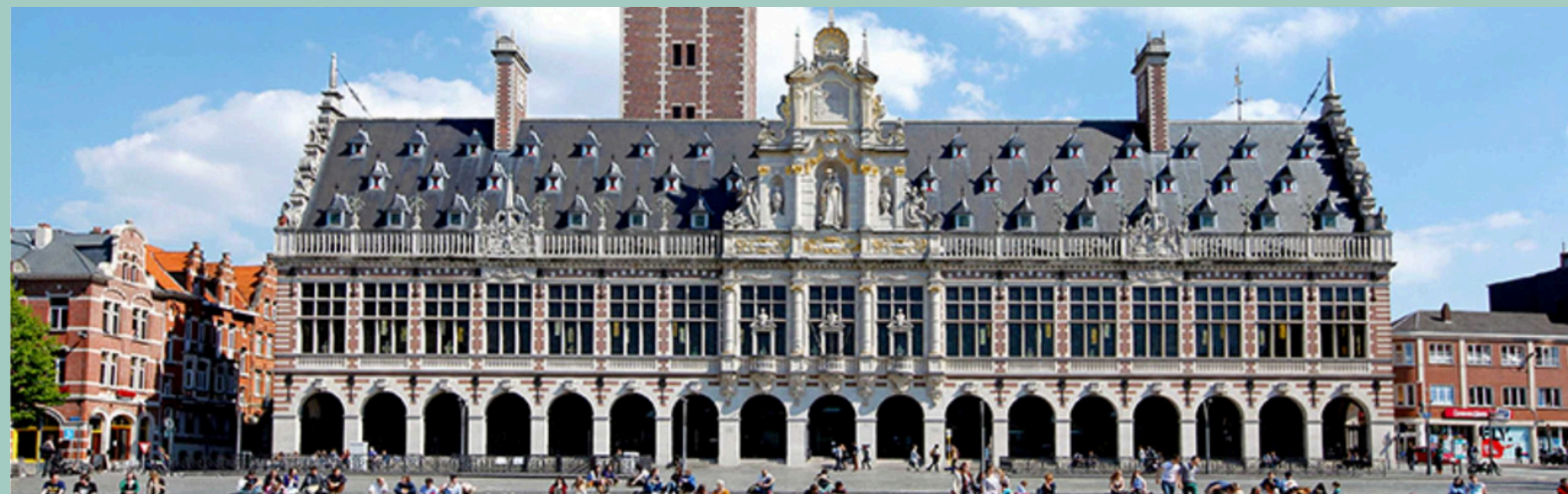
KU Leuven, Belgium