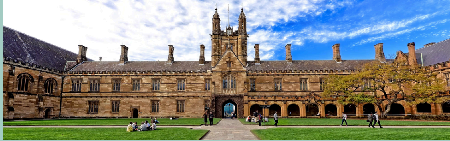
University of Sydney, Australia