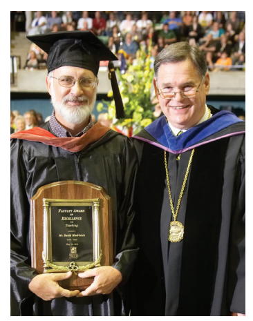
Faculty Award of Excellence for Teaching