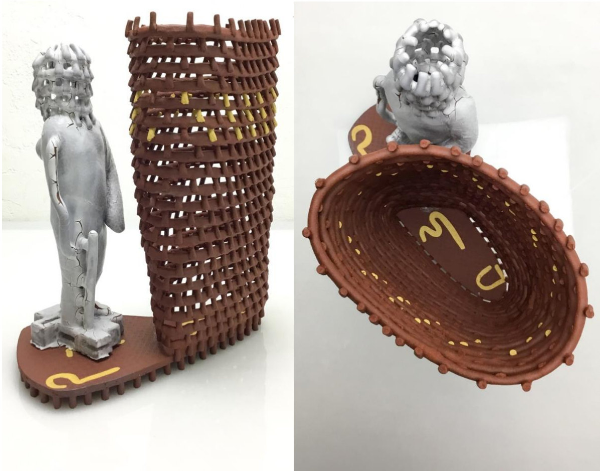
Janus Figure with Structural Screen Terra Cotta, Yellow Stoneware, Porcelain Slip

A series of statuary were also developed in response to “Beyond Compare: Art from Africa in the Bode Museum “.The exhibition paired Christian and African sculptures and relics in order to show the parallels in belief structures and use of art as objects of worship.