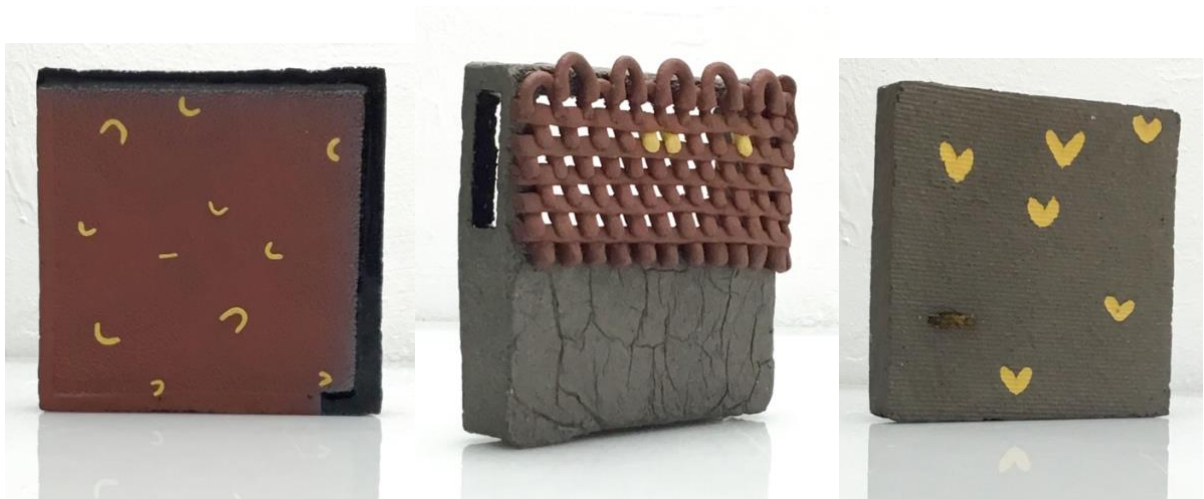
A series of smaller compositional studies were made to test the adhesion of the three different clays and their interaction with an iridescent metallic glaze