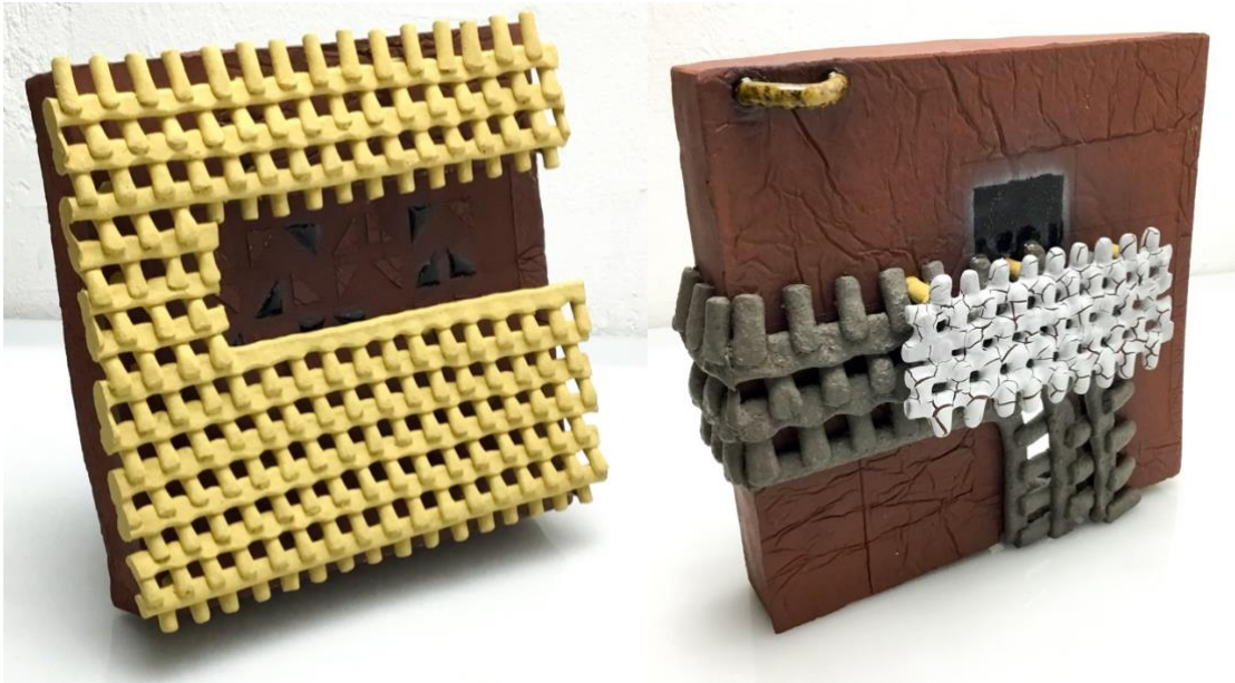
Architectural Tile Study: Yellow Screen Terra Cotta, Yellow Stoneware, Glaze

In addition to the design of tile for use as architectural adornment and furniture, we used to format to collaborate on formal compositions that responded to sites like the Reichstag Building, The Bauhaus Archive Museum , Le Unite de Habitation, the Berlin Philharmonic, the Berlin Wall, and the contrast of communist block housing with ornamented Bavarian architecture.