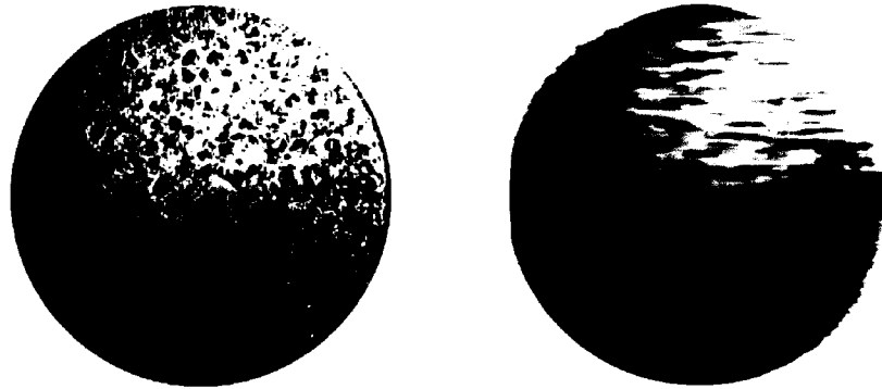
Kalinga Gangsa drums in motion - A photograph effects in Adobe Photoshop

The merwas plays patterns combining the ringing and dampened sounds. It is characterized by the prominent use of dampened sounds.